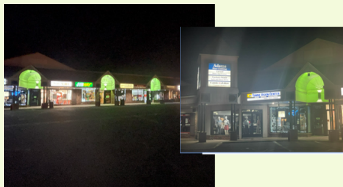
Adams Shopping Center New Providence, NJ, 2022